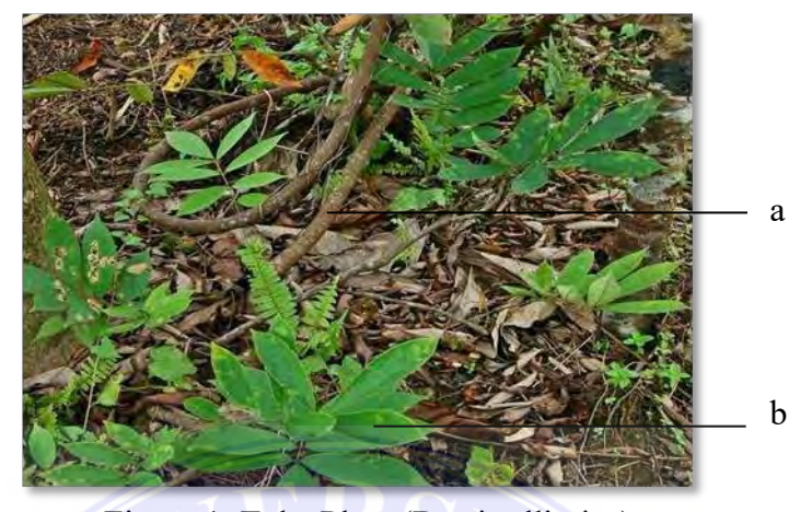
Figure 1. Tuba Plant (Derris elliptica) Description: a = tuba root; b = tuba leaf

Toxic compounds from tuba roots should not be transferred into rivers because they can kill aquatic ecosystems (Olufayo, 2009).