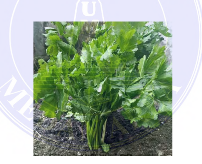
Figure 2. Celery Plant ( Apium graveolus L.)

Celery can grow 1 to 2 feet facilitating urination. The stems are rather rigid and crescent-shaped and have compound leaves (segmented) with a serrated margin. In June and July, it produces small white flowers which later develop into fruit with fine seeds. Wet soil with acidic properties is a suitable growing environment for celery. Celery seeds have a distinctive odor with a slightly bitter taste (Kardinan, 2011).