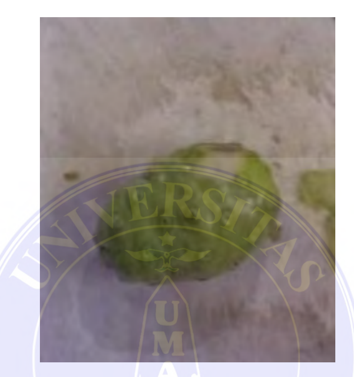
Figure 3. Noni ( Morinda citrifolia )

Sirait (2008), alkaloids are the outcome of the largest secondary metabolic compounds in plants lodging basic nitrogen atoms as a combination of the heterocyclic system.